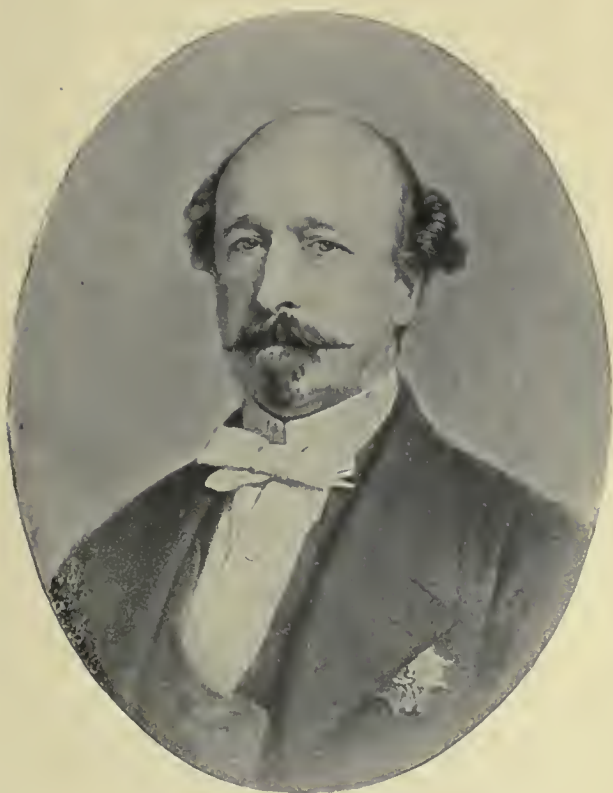
THE DUKE OF MORNAY.